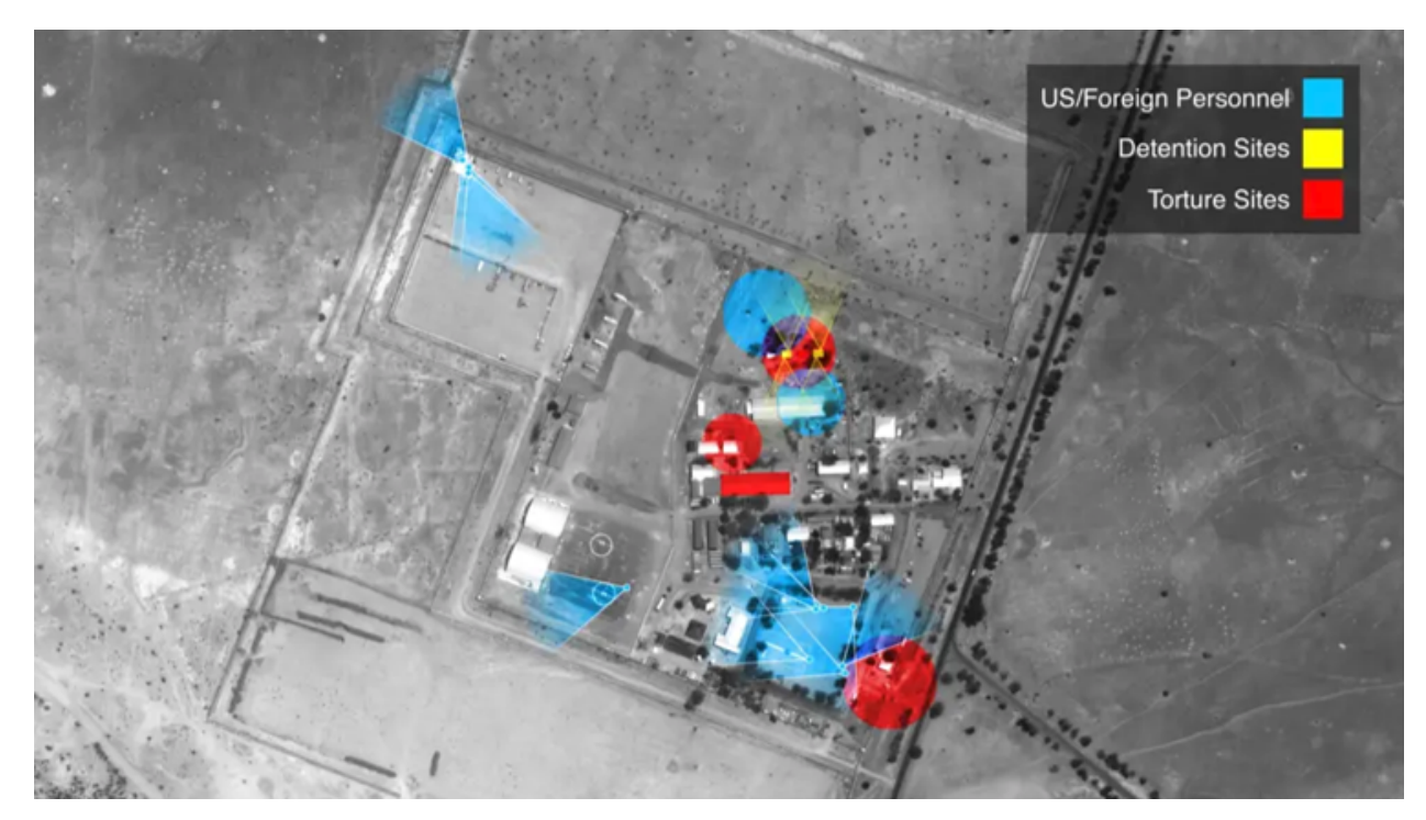
Forensic Architecture, Torture and detention in Cameroon, 2017

Since 2014, Cameroon has been at war with Boko Haram, an armed extremist group responsible for thousands of murders and abductions across the Lake Chad Basin.