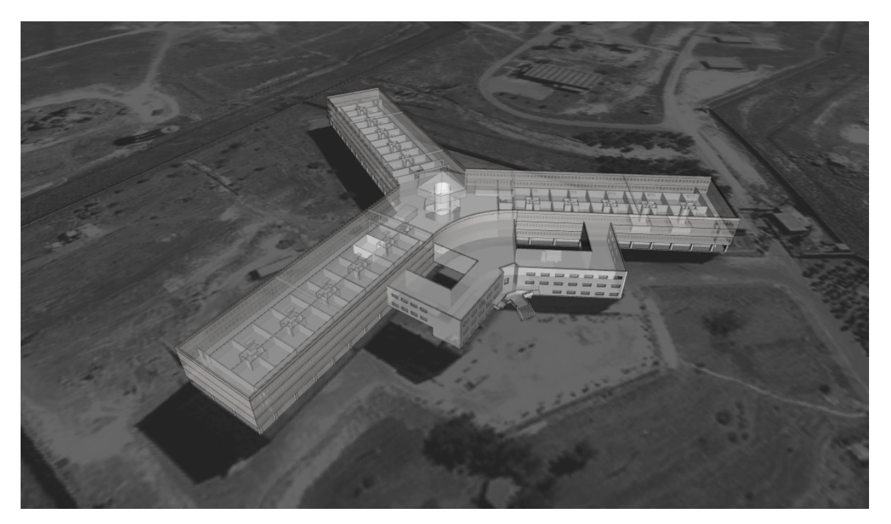
Forensic Architecture, Saydnaya, 2016

Since 2011 thousands have died in Syria's prisons and detention facilities. With anyone perceived to be opposed to the Syrian government at risk, tens of thousands of people have been tortured and ill-treated in violation of international law.