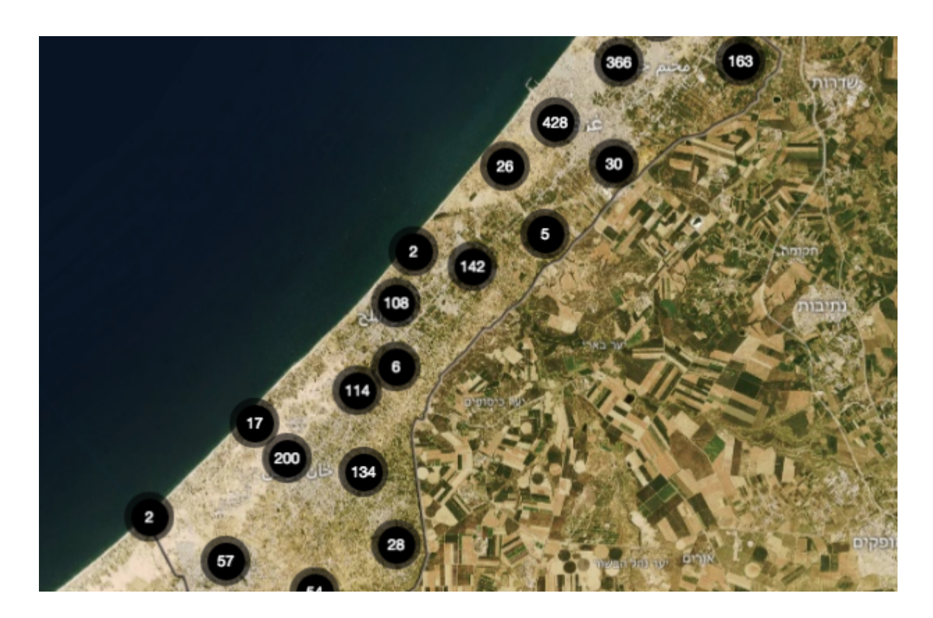
Forensic Architecture, The Gaza Platform, 2015

The Gaza Platform enables its users to explore a vast collection of data, collected on the ground by the Al Mezan Center for Human Rights and the Palestinian Centre for Human Rights (PCHR), as well as Amnesty International, during and after the 2014 conflict.